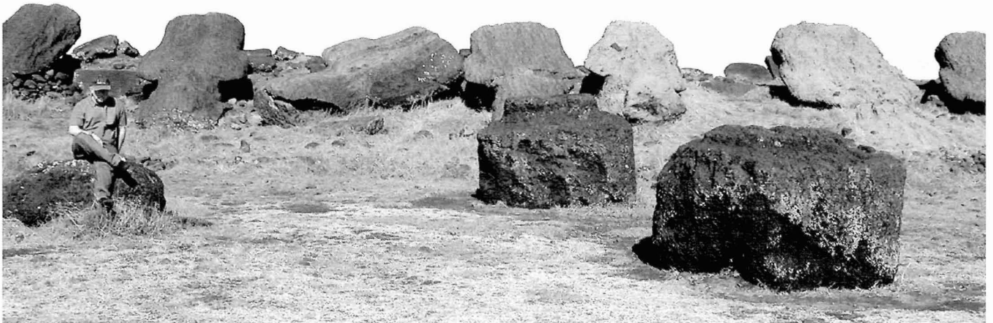
Thomson's 1866 photo of Ahu Vaihu (top) vs Love's 2006 photo. Thomson incorrectly referred to this structure as Ahu Tongariki.