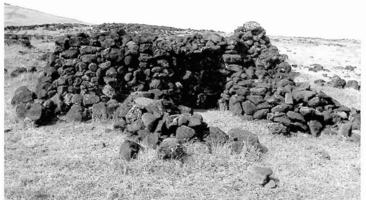
Thomson's 1886 sketch of a north coast tupa (left) and Love's 2006 photograph (above). Thomson called this structure an observation tower. It is located four ahu to the east of La Pérouse bay. The 'tower' has collapsed but it appears to be the same structure.

Archaeologist Charlie Love has had an ongoing project for many years: that of exploring Rapa Nui with a copy of Thomson's 1886 book in hand. He photographs the sites, taking care to duplicate the same view as is shown in the early pictures. At top, a view of Ahu Vaihu taken by Thomson is compared to a recent photograph by Love. A moai head in the Thomson photograph has a crack, but Love's 2006 photograph shows that section has fallen off. Love is compiling "then vs. now" photographs, not only from Thomson but also from Routledge. While the most obvious differences are often new lichen growth, small shrubs are turning into trees and obscuring many moai , both at Rano Raraku as well as at sites along the south coast road.